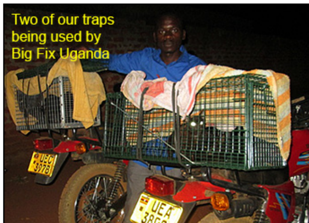
Two of our traps being used by Big Fix Uganda

Rabies is pretty common in Kathmandu and the KAT Centre replies to almost all of the city's calls about rabid dogs, so the gloves (SNIP International gave) are important to keep our staff safe.