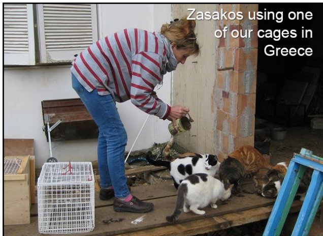
Zasakos using one of our cages in Greece

"We're very grateful for your kind donation. We were able to start the TNR program earlier (and neuter 39 cats)."